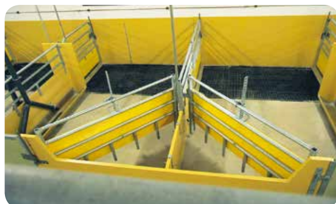
Piggery Stall Walls