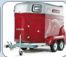
Horse Float Tail Gate, Tack Box & Sidewalls.