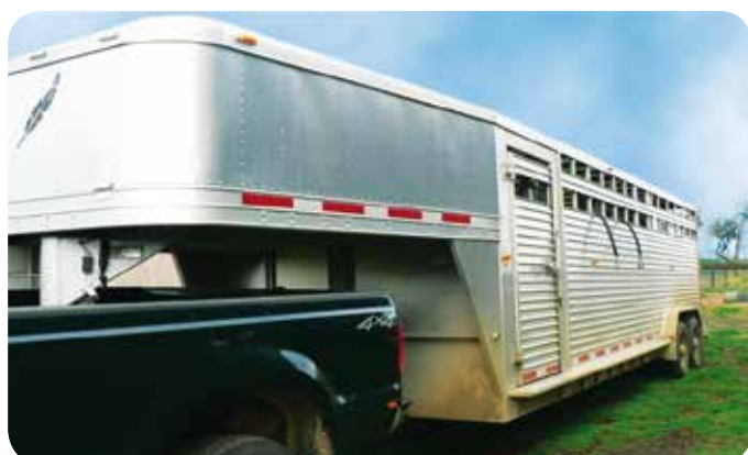
Horse Interior Walls

Uniboard ECO (Coloured) is an extruded flat sheet with a lightweight foamed centre core manufactured from recycled Polyethylene (HDPE) sandwiched between outer skins of solid structural virgin polyethylene (HDPE). Uniboard coloured sheets are UV stabilised to provide a colour fast material that is ideal for exterior applications.